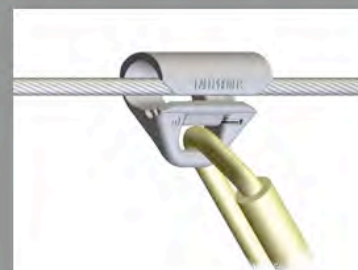
3. Carabiner on glider