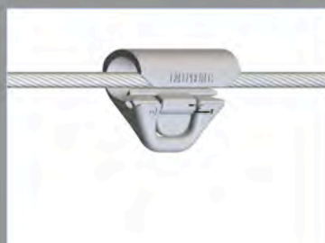
1. Locking device open

Glider LDV001 connection: Glider LDV 001 must be connected to the cable prior to attach the carabiner.