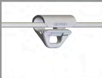
2. Locking device closed