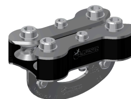
LDV060 Captive Glider LDV093 Trolley on bearings

> LDV 053 End anchor: Stainless Steel SS316 wall fixing including energy abs + turnbuckle.